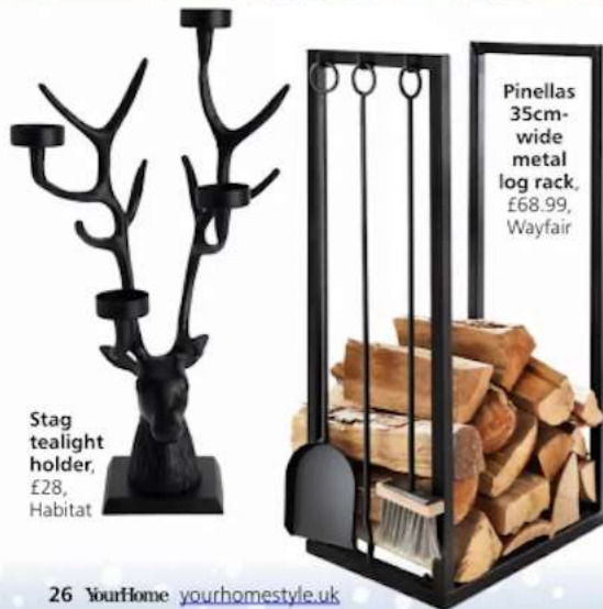
Stag tealight holder, £28, Habitat