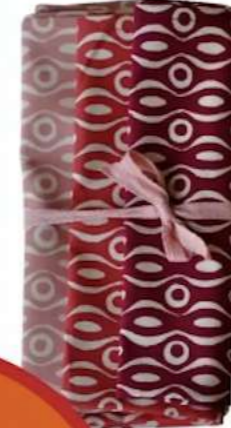
▼ Persephone tea towels, £27.50 for a set of 3, Cambridge Imprint