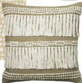
► Furn Greta cushion, £19, Very