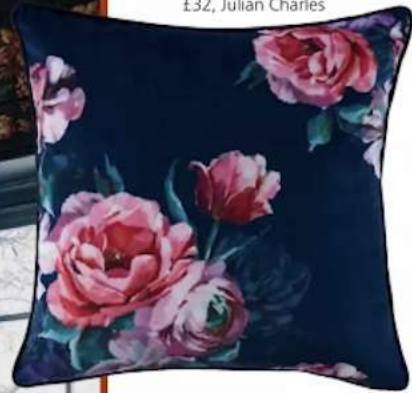
▼ Kara Navy Blue floral printed velvet cushion, £32, Julian Charles