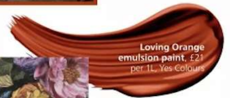
Loving Orange emulsion paint, £21 per 1L, Yes Colours