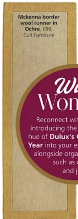
Mckenna border wool runner in Ochre, £99, Cult Furniture

Wild Wonder Reconnect with nature by introducing the neutral sandy hue of Dulux's Colour of the Year into your existing scheme alongside organic materials such as cotton and jute