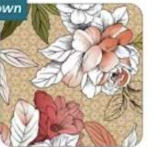
▲ Pimpernel floral sketch coasters, £10.50 for a set of 6, Portmeirion

Create a cosy scene by doubling down on darker shades, and pull out colours from the wallpaper to incorporate throughout the rest of the room Florenzia Dusk wallpaper, £65 per roll, Graham & Brown