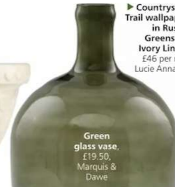
Green glass vase, £19.50, Marquis & Dawe