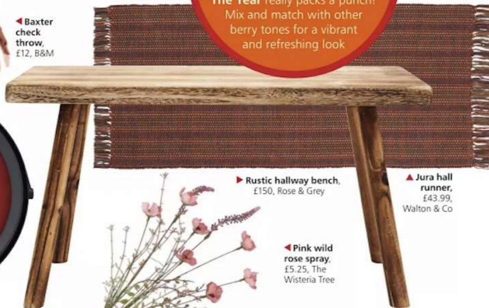
▲ Jura hall runner, £43.99, Walton & Co