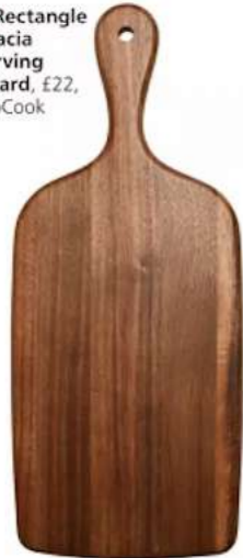
▶ Rectangle acacia serving board, £22, ProCook

'Raspberry Blush, although bold, is surprisingly versatile. You can go all out and create a colour-drenched room with complementary pinks and cinnamons. Or you can pair it back with a neutral shade, perhaps as an accent wall' Helen Shaw, Director at Benjamin Moore UK