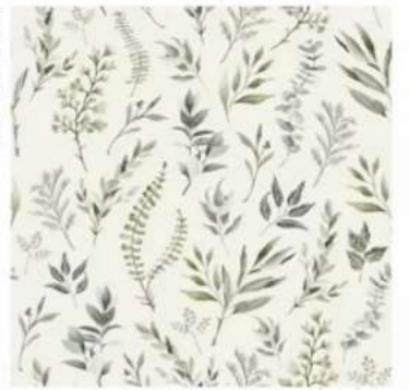
▶ Countryside Trail wallpaper in Rustic Greens on Ivory Linen, £46 per roll, Lucie Annabel

The leaf motif on these tiles adds a delicate detailing to an otherwise practical kitchen space, which is further softened by raw wood finishes Paradis Mere tiles, £4.96 per tile, Original Style