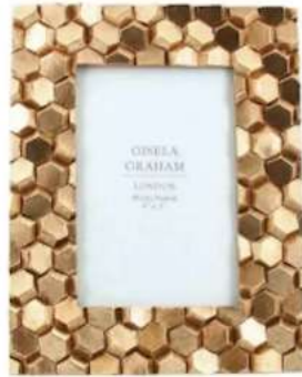
◀ Gold Hexagon Geo resin photo frame, £14.99, Gisela Graham

'Raspberry Blush, although bold, is surprisingly versatile. You can go all out and create a colour-drenched room with complementary pinks and cinnamons. Or you can pair it back with a neutral shade, perhaps as an accent wall' Helen Shaw, Director at Benjamin Moore UK