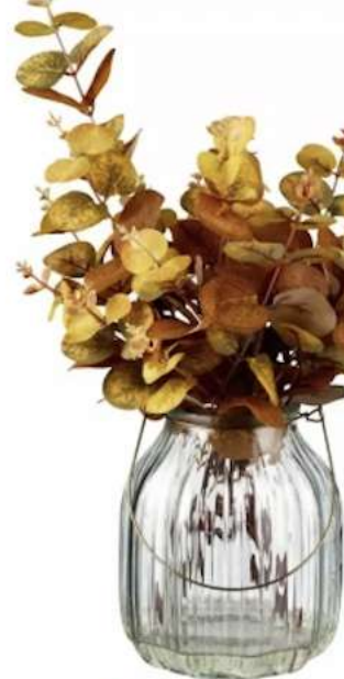
▲ Preserved eucalyptus in glass jar, £12, B&M