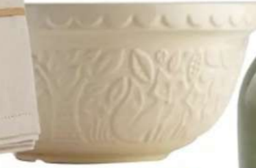
▼ Mason Cash in the Forest 29cm bowl, £20, Dunelm