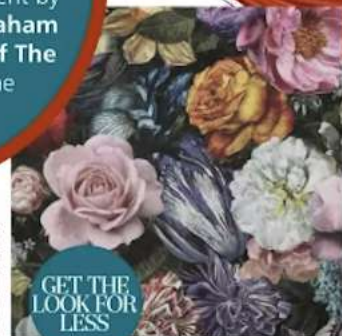
► Superfresco Easy Bruges multicolour floral smooth wallpaper, £24 per roll, B&Q