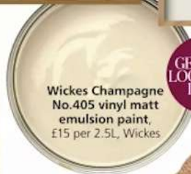
Wickes Champagne No.405 vinyl matt emulsion paint, £15 per 2.5L, Wickes