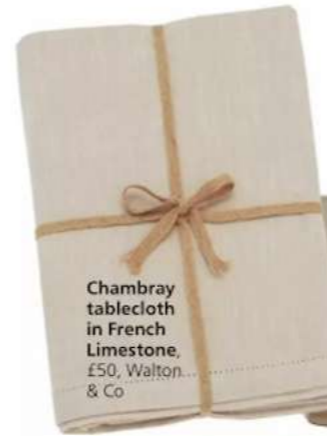
Chambray tablecloth in French Limestone, £50, Walton & Co