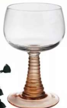
▲ Swirl wine glass, £9.95, Idyll Home