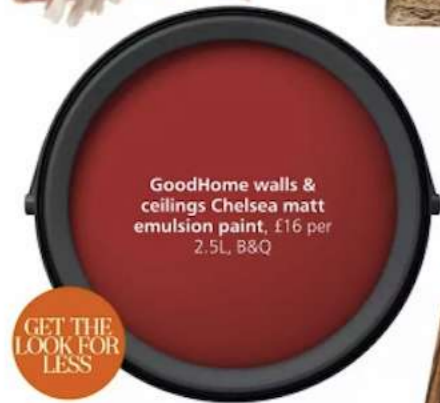
GoodHome walls & ceilings Chelsea matt emulsion paint, £16 per 2.5L, B&Q

Keep the rest of your styling simple when using a bold colour indoors, and let the walls do the talking Raspberry Blush paint, from £20 per 0.94L, Benjamin Moore