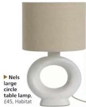
► Nels large circle table lamp, £45, Habitat

Be inspired by the latest paint colours, wallpaper patterns, and tile designs set to be this year's decorating must-haves, and discover how to bring them into your home