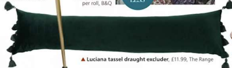
▲ Luciana tassel draught excluder, £11.99, The Range