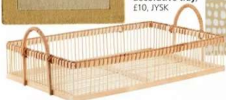
▼ Melvin decorative tray, £10, JYSK