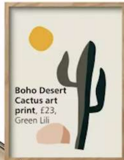
Boho Desert Cactus art print, £23, Green Lili