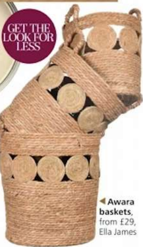
▲ Awara baskets, from £29, Ella James