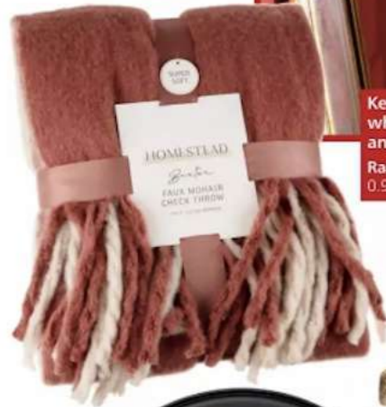
◀ Baxter check throw, £12, B&M