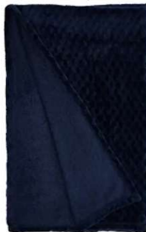
▲ Willow recycled throw in Navy, £12, Dunelm