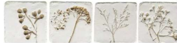
▲ Flower imprint coasters, £13 for a set of 4, National Trust