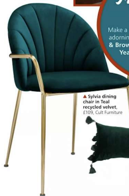
▲ Sylvia dining chair in Teal recycled velvet, £109, Cult Furniture

Florenzia Dusk Make a glamorous statement by adorning your walls in Graham & Brown's Wallpaper Of The Year , and complete the look with luxe details