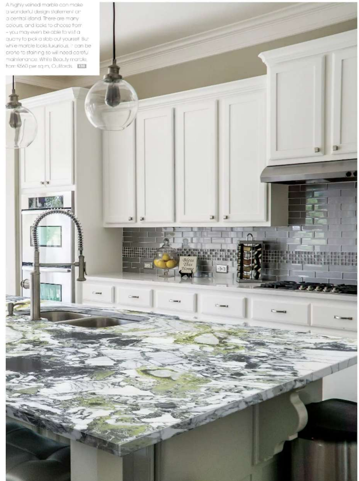
A highly veined marble can make a wonderful design statement on a central island. There are many colours, and looks to choose from – you may even be able to visit a quarry to pick a slab out yourself. But while marble looks luxurious, it can be prone to staining so will need careful maintenance. White Beauty marble, from £560 per sq m, Cullifords. KBB