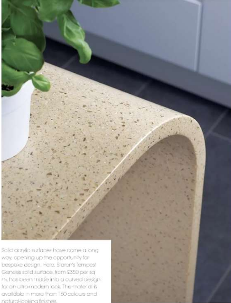
Solid acrylic surfaces have come a long way, opening up the opportunity for bespoke design. Here, Staron's Tempest Genesis solid surface, from £350 per sq m, has been made into a curved design for an ultra-modern look. The material is available in more than 150 colours and natural-looking finishes.