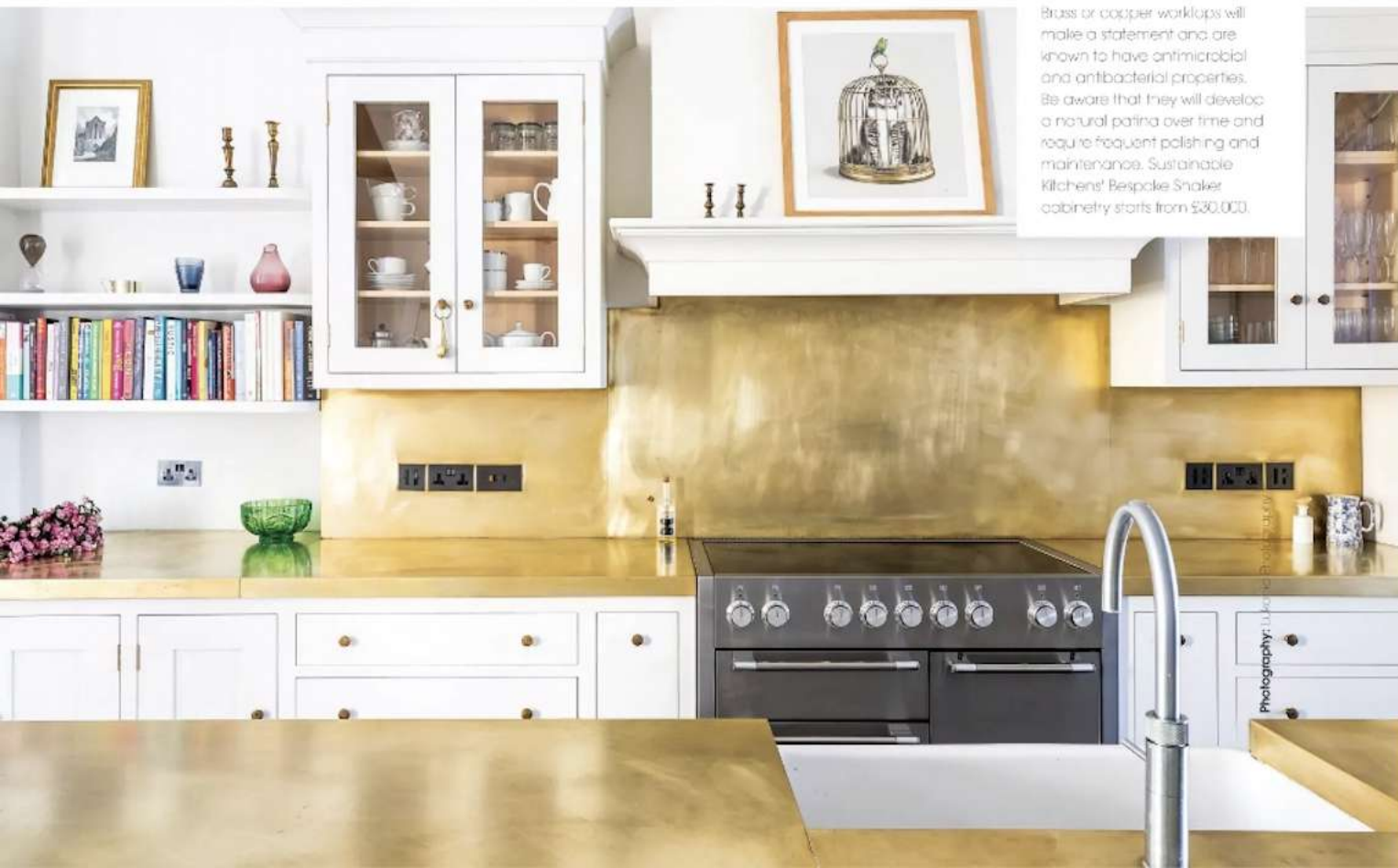
Brass or copper worktops will make a statement and are known to have antimicrobial and antibacterial properties. Be aware that they will develop a natural patina over time and require frequent polishing and maintenance. Sustainable Kitchens' Bespoke Shaker cabinetry starts from £30,000.