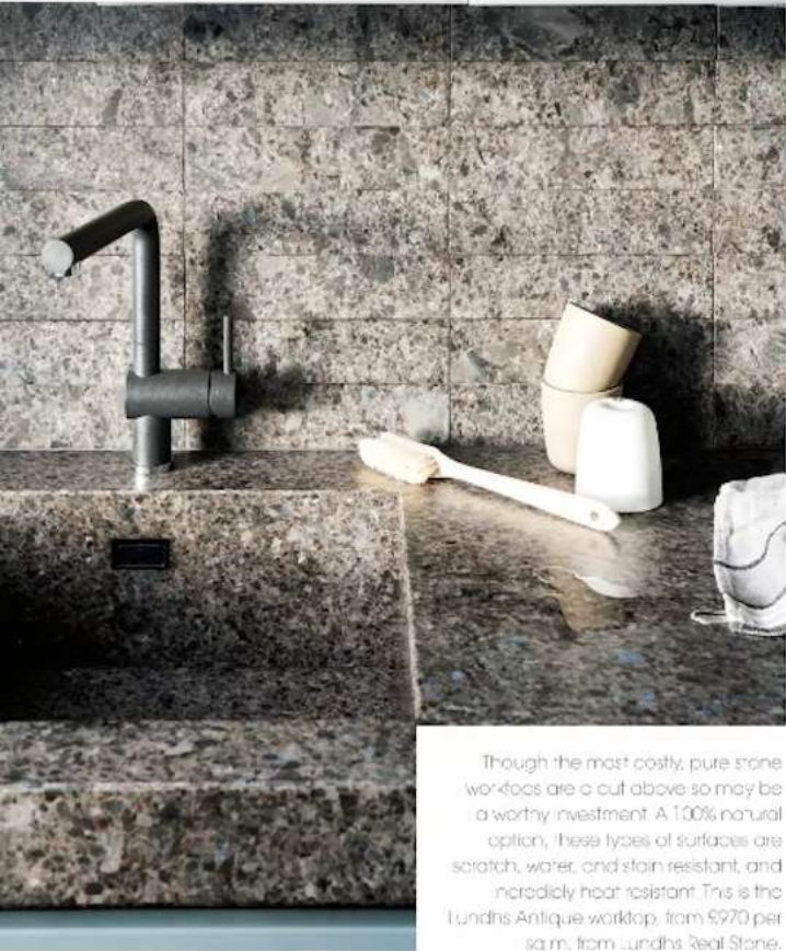
Though the most costly, pure stone worktops are a cut above so may be a worthy investment. A 100% natural option, these types of surfaces are scratch, water, and stain resistant, and incredibly heat resistant. This is the Lundhs Antique worktop, from £970 per sq m, from Lundhs Real Stone.