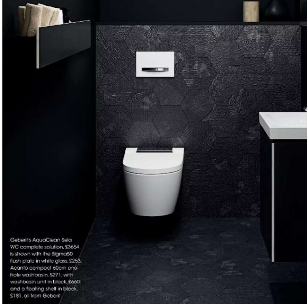
Geberit’s AquaClean Sela WC complete solution, £3654, is shown with the Sigma50 flush plate in white glass, £253, Acanto compact 60cm one-hole washbasin, £271, with washbasin unit in black, £660, and a floating shelf in black, £181, all from Geberit.

“One solution to reduce the transfer of germs is to opt for products such as sensor-activated taps and flush plates. Likewise, handle-free furniture and sensor-activated lighting on cabinets will also help reduce unnecessary surface contact. Wall-hung fittings allow for easy cleaning below – vital for reaching any germs or dust that might be gathering out of sight. What’s more, these designs will hide unsightly pipework behind the wall too – an added bonus.”