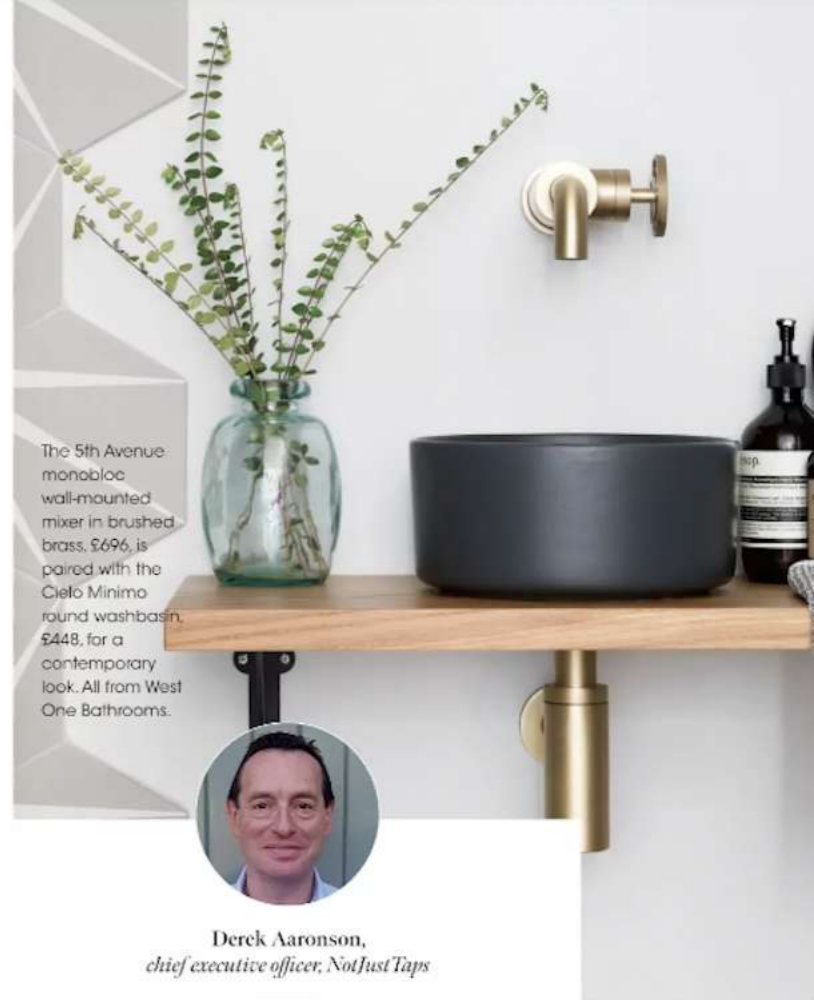
The 5th Avenue monobloc wall-mounted mixer in brushed brass, £696, is paired with the Cielo Minimo round washbasin, £448, for a contemporary look. All from West One Bathrooms.