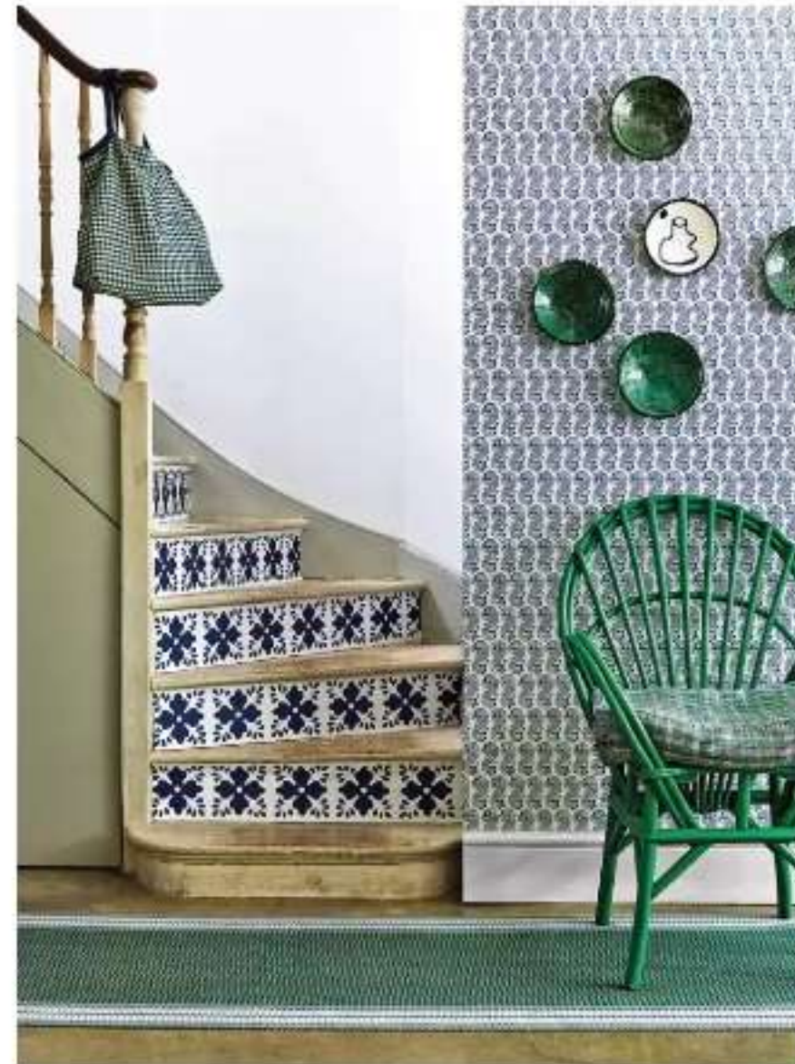
For similar wallpaper , try Paint & Paper Library. For similar tiles , try Otto Tiles & Design

Stencilling or even tiling the side of each step on a staircase will bring an unsuspecting splash of pattern. Look to use similar colours or shapes found elsewhere on your landing or hallway to create cohesion. You may even want to introduce wallpaper for extra impact. 'Wallpaper is seeing another renaissance, as people seek out colour and pattern that injects joy into an interior,' explains Ruth Mottershead, creative director at Little Greene and Paint & Paper Library. 'Green and blue tones are becoming increasingly popular,' she adds.