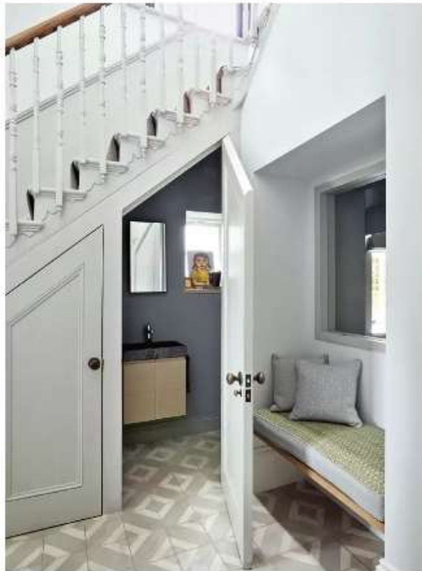
For similar flooring , try Amtico

A patterned floor can really lift the look and feel of hallways and opting for a flooring such as luxury vinyl tiling (LVT) works well in high-traffic areas as it is highly durable against water and moisture, as well as being stain and scratch resistant. Take the flooring into under-stair cupboards and cloakrooms. A built-in bench seat to take shoes on and off is also good usage of an alcove. Make it comfy with a padded cushion and reflect light with a landscape mirror.