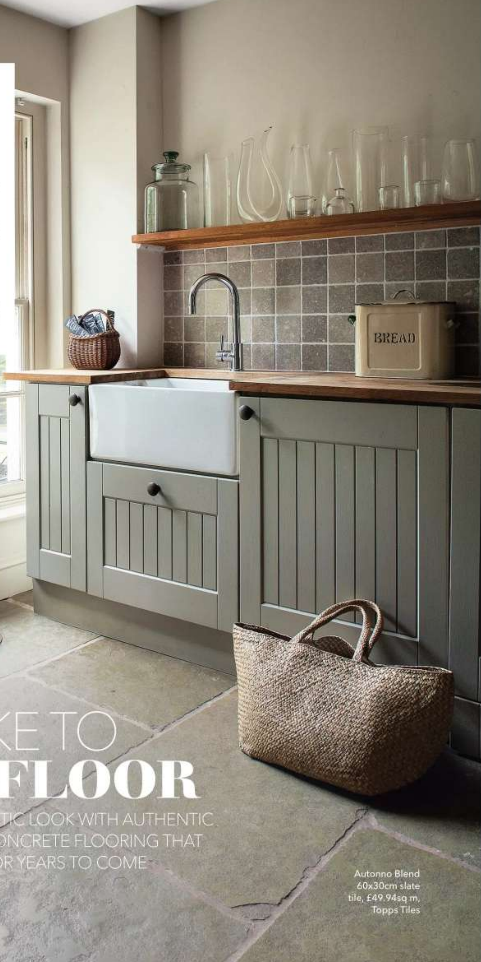
Autunno Blend 60x30cm slate tile, £49.94sq m, Topps Tiles

'Slate is known for its rusty copper colours, combined with deep shades of charcoal and silver, all of which can work together to create a rustic look, perfect for period properties and quaint cottages,' says Harriet Goodacre, tile consultant at Topps Tiles. It is important that slate is polished and properly sealed to prevent any chips or staining. 'When sealing, you can add a colour intensifier to enhance the look, giving a glossy sheen for an even more eye-catching appearance,' adds Harriet.