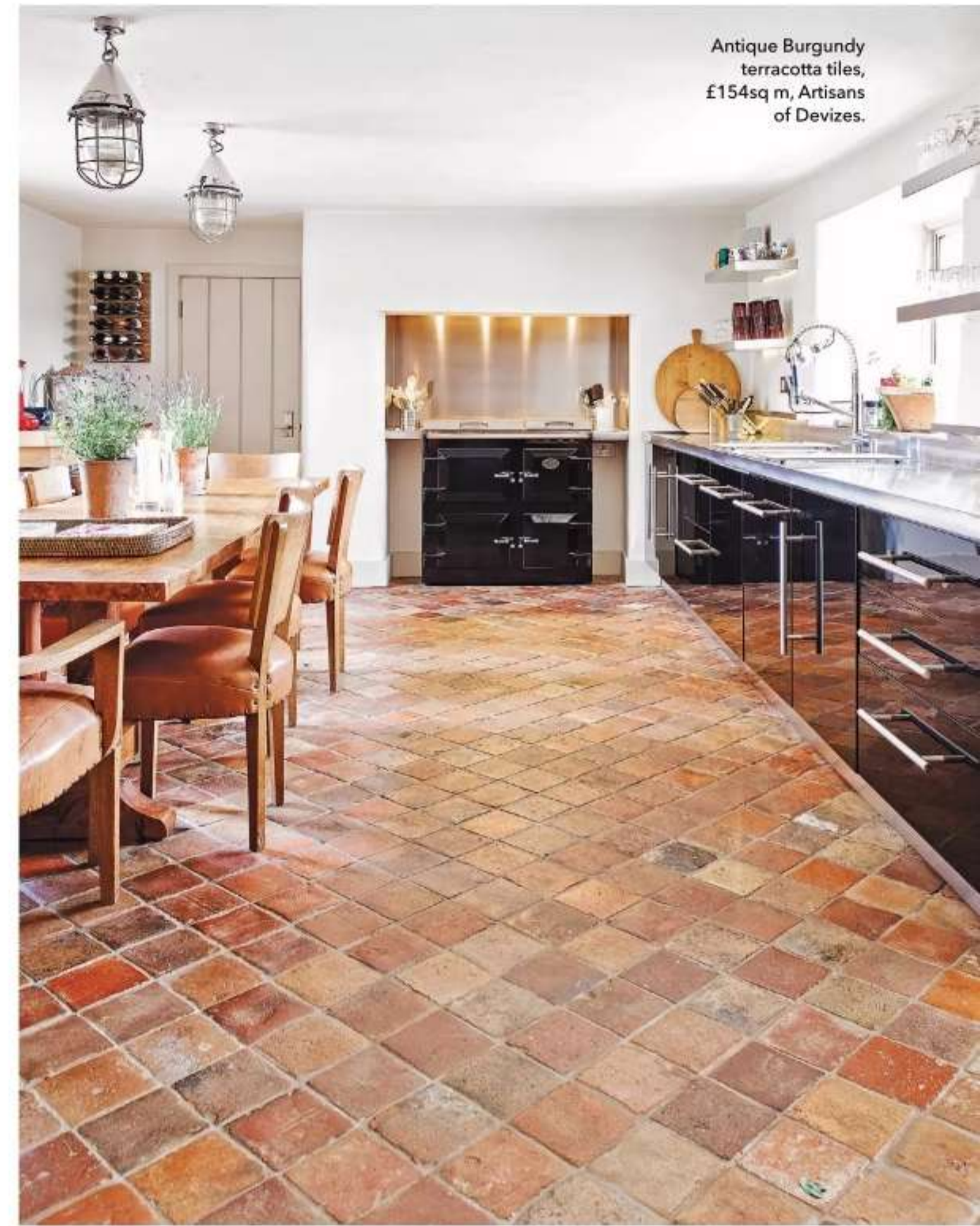
Antique Burgundy terracotta tiles, £154sq m, Artisans of Devizes.

By their very nature, most authentic stone floors are only available in neutral colours. However, terracotta offers richer, reddish tones underfoot and can also be glazed if a more shiny finish is desired. It’s remarkably long-lasting, so you will be able to find reclaimed tiles easily, though it is always best to go through a reputable supplier so they can source quality pieces on your behalf. As with all stone flooring, terracotta tiles work well with underfloor heating.