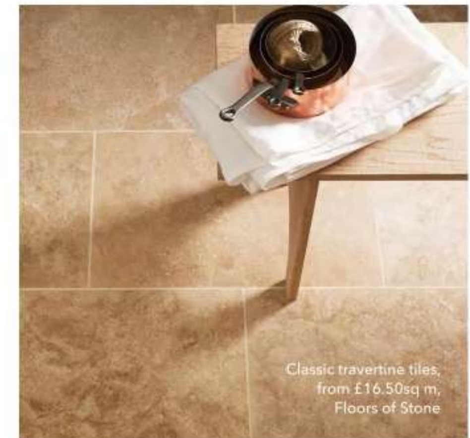
Classic travertine tiles, from £16.50sq m, Floors of Stone