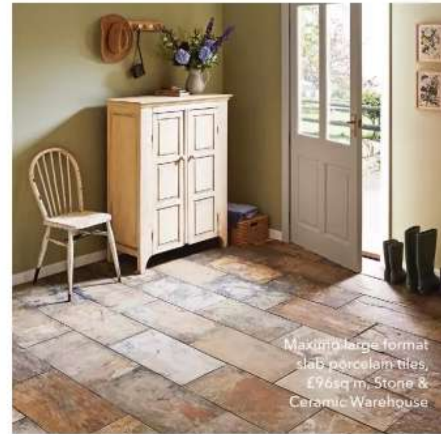
Maximo large format slab porcelain tiles, £96sq m, Stone & Ceramic Warehouse

ACHIEVE A TRULY RUSTIC LOOK WITH AUTHENTIC STONE, TILE AND CONCRETE FLOORING THAT WILL LAST FOR YEARS TO COME