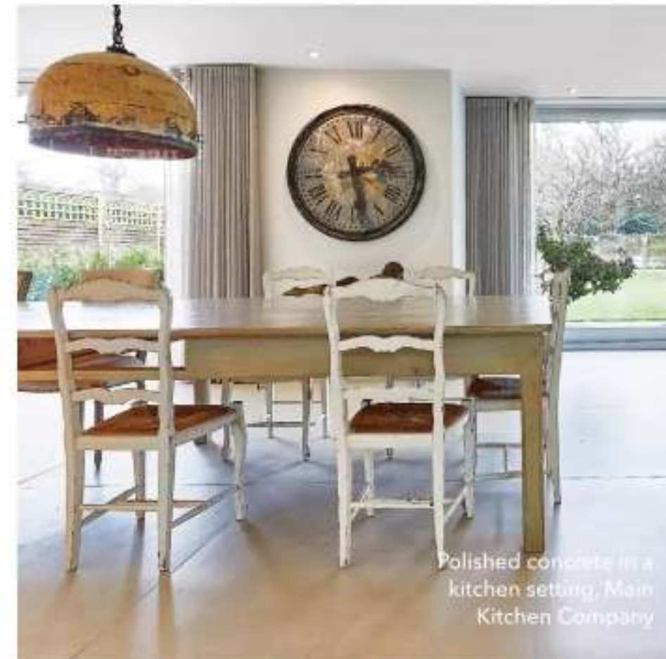
Polished concrete in a kitchen setting, Main Kitchen Company