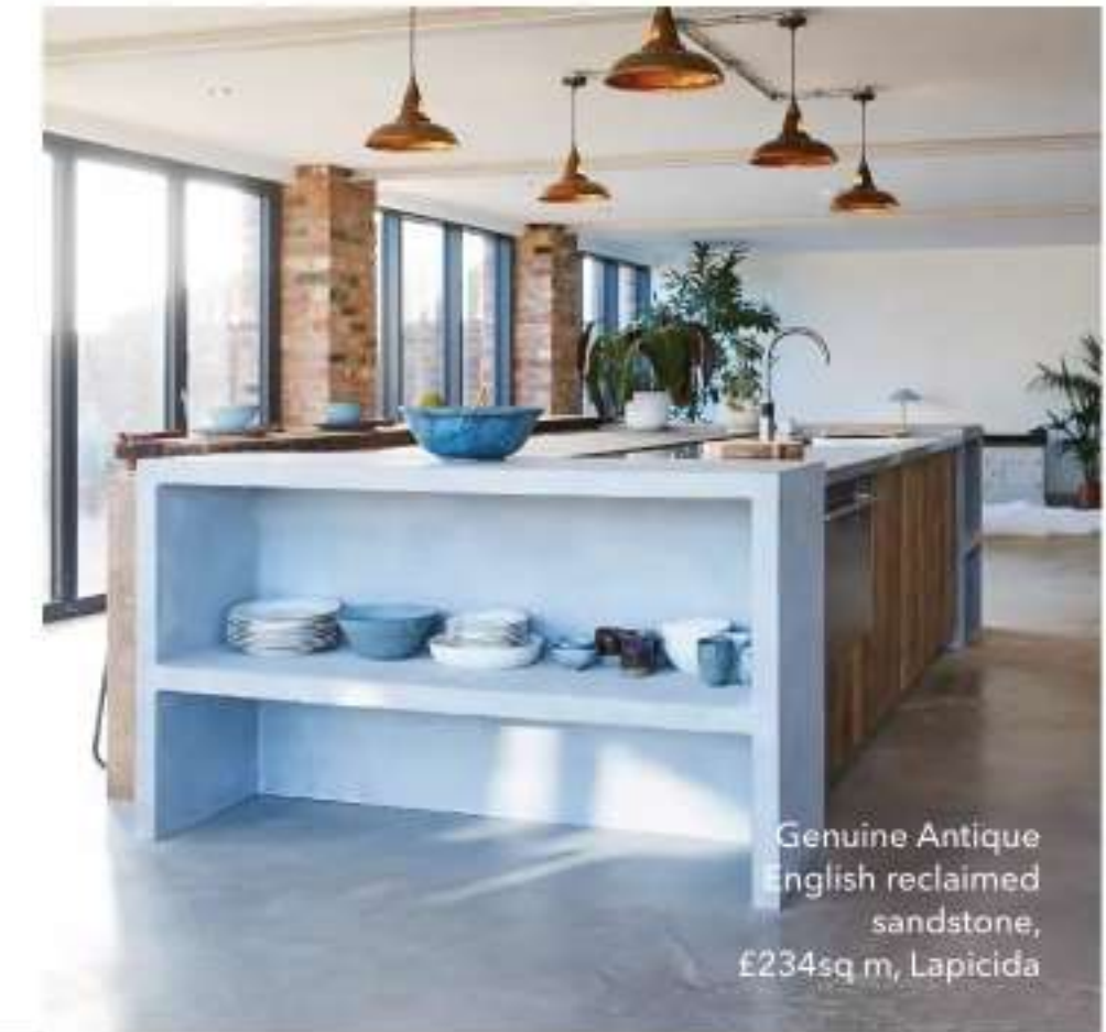
Genuine Antique English reclaimed sandstone, £234sq m, Lapidica